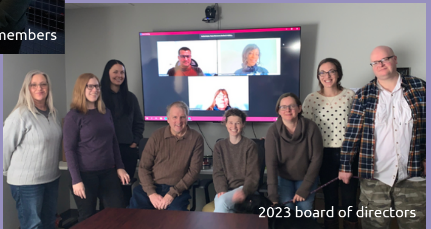
2023 board of directors