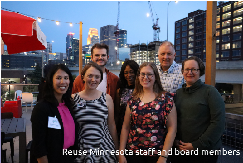
Reuse Minnesota staff and board members

Reuse Minnesota believes in the value of all people and chooses to be an organization that not only welcomes diverse voices and perspectives, but actively seeks to incorporate them. We are committed to ensuring individuals of all abilities, ages, body sizes, cultural backgrounds, gender identities, income levels, races, and sexual orientations feel respected in our efforts. We ground this commitment by intentionally creating inclusive access for the opportunities and resources we offer.